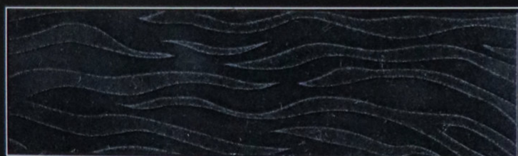
717 - Zebra

LYNEL doesn't offer "THERMO" heat-burnishing effect after hot-stamping.