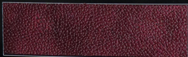
981 - Tann