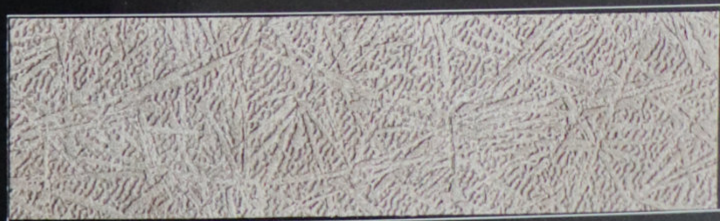
729 - Twig