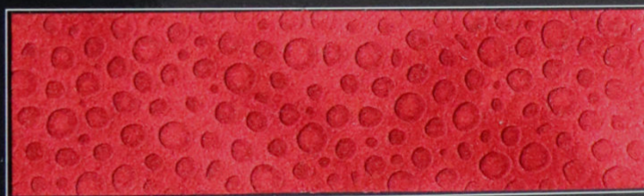
715 - Manta