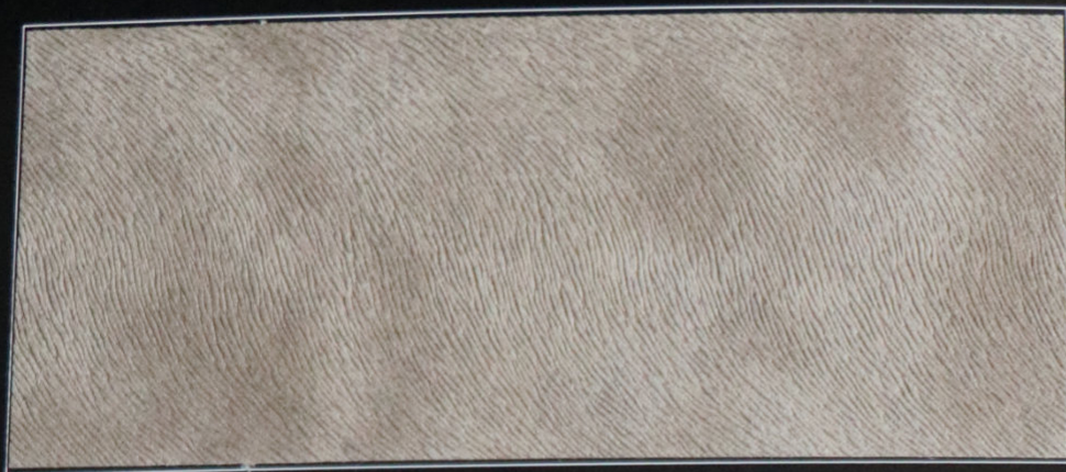
Lynel Thermo fur 729